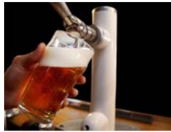
Beer And Water For Lent