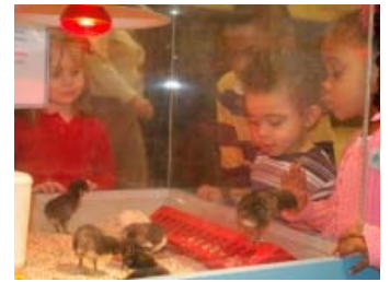
Things To Do This Weekend