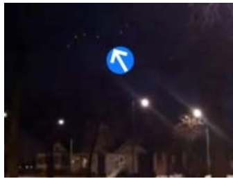
UFO Sightings Reported