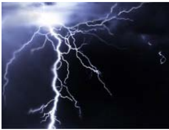
Storms Rumble Overnight