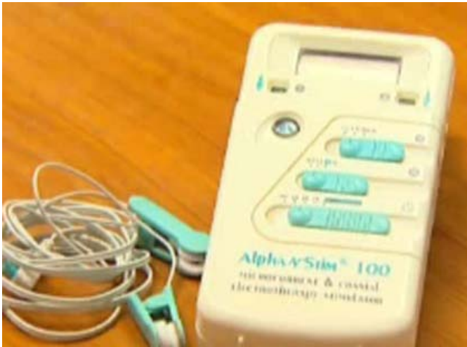
This Alpha-Stim device purportedly can help fend off depression and anxiety.