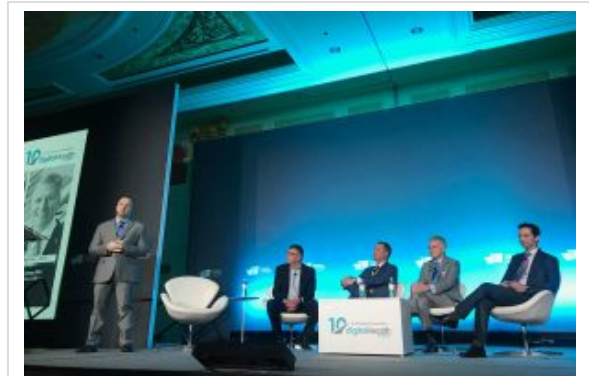
Doctors and engineers hosted a panel on neuromodulation at the 2018 Consumer Electronics Show in Las Vegas.

The nerve stimulation devices presented at the 2018 Consumer Electronics Show all employ this technology that is proven to treat pain; the downside to these devices, however, is that they are invasive and often uncomfortable or cumbersome. One model attaches to the side of the user’s head; another uses needles to stimulate nerves in the spine.